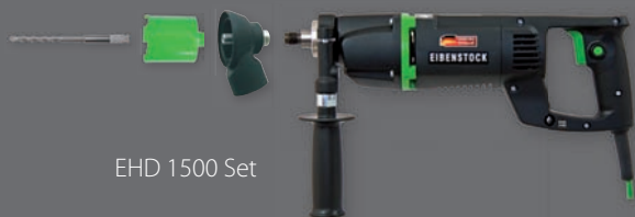
EHD 1500 Set